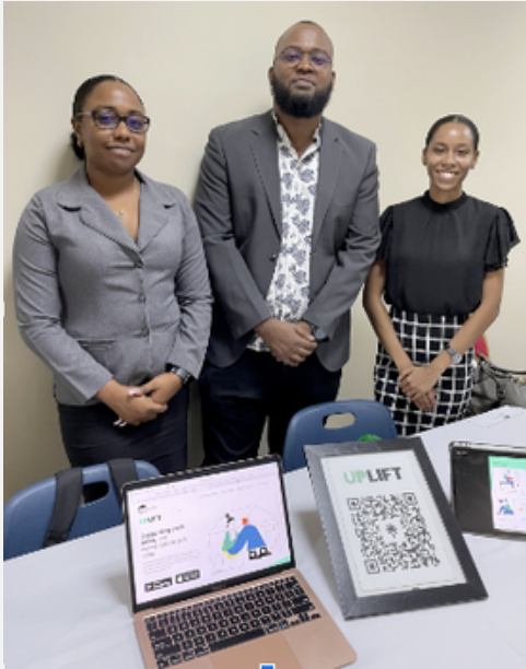
CtrlAltFix Tech team, Software Development Company Based in Trinidad and Tobago